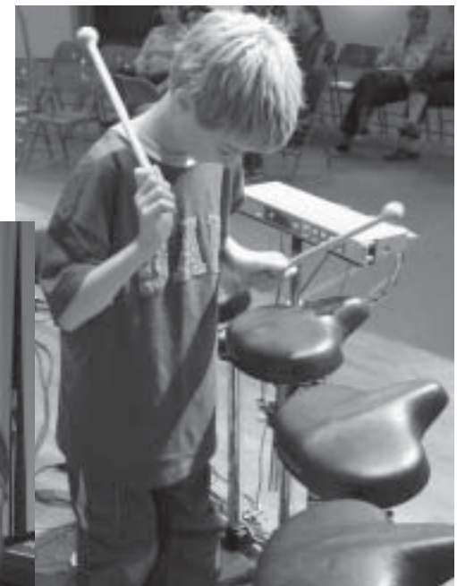
Participants in Kurt Wold's Play The Bicycle Workshop.